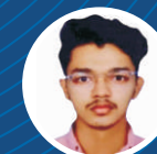
Nihal KR Bakery, Malappuram