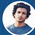
Shaffaf KAAF Logistics Saudi Arabia