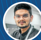
Safer P Entigrity, US & Canada Based Company, Kochi