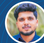
Abdullah Al Makarem Food Trading Company, SA