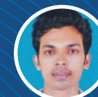
Luthfi Malabar Gold, Calicut